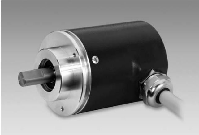
GXP1W with clamping flange